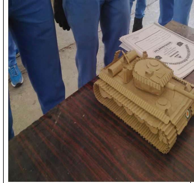
POSTERS AND MODELS by N.C.C. CADETS

Pulse Polio Abhiyaan – 10<sup>th</sup> March 2019